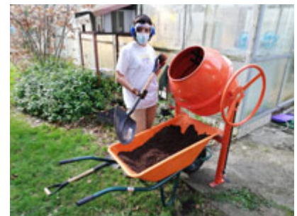
Custom Mix provides an alternative for this