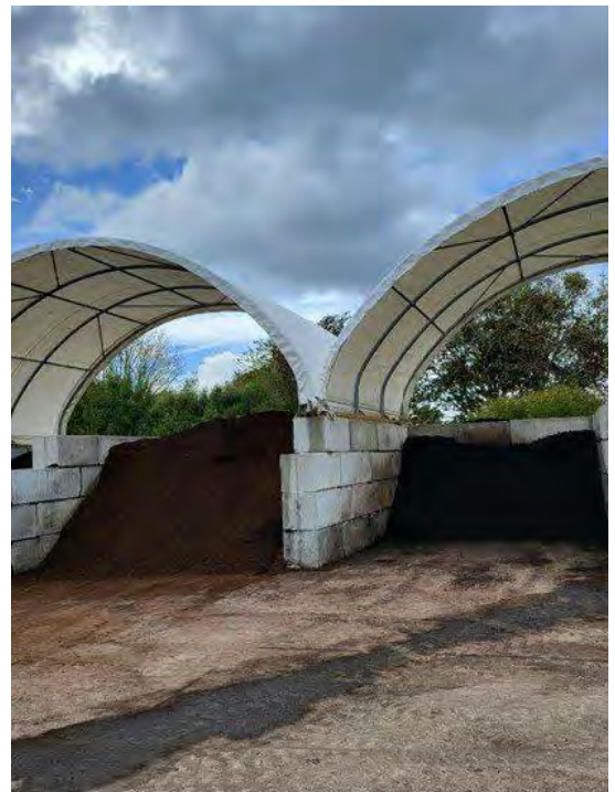
Covering the new bins with brilliant covers imported by Co Power