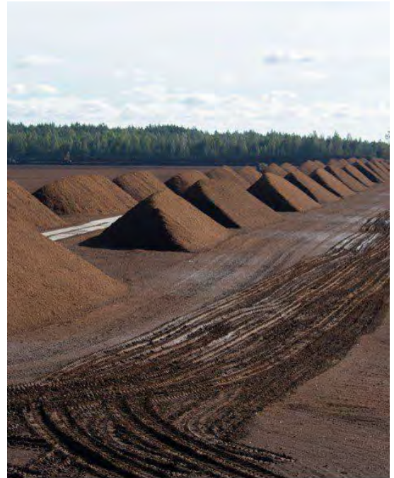
Uncovered material stockpiles means supply arrives saturated

Peter has a few projects to finish off before he leaves us to move to Christchurch later this Autumn.