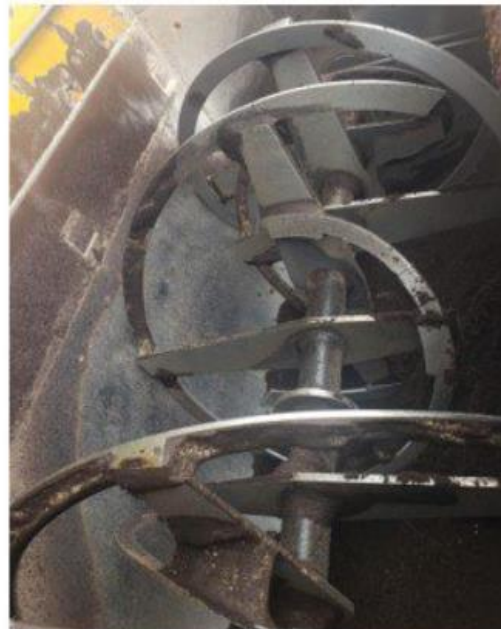
Big cake mixer

The principal is shared with the better cake mixers, with the same care prioritized for retaining the integrity of each ingredient input without destroying its texture and individual benefits that it brings to the blend.